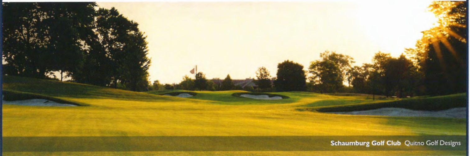
Schaumburg Golf Club Quitno Golf Designs

This 27-hole municipal facility, operated by the Schaumburg Park District, was looking to secure its place in the Chicago market as a premier golf destination and preserve long-term viability for the next generation by addressing a failing infrastructure and agronomic issues with the existing greens. The course was renovated nine holes at a time over three seasons, including a total rebuild of the greens and bunkers, resurfacing of tees and fairways, moving of two holes to allow expansion of the range and greater flood control, enhanced chipping and putting complexes, and overall site detail improvements.