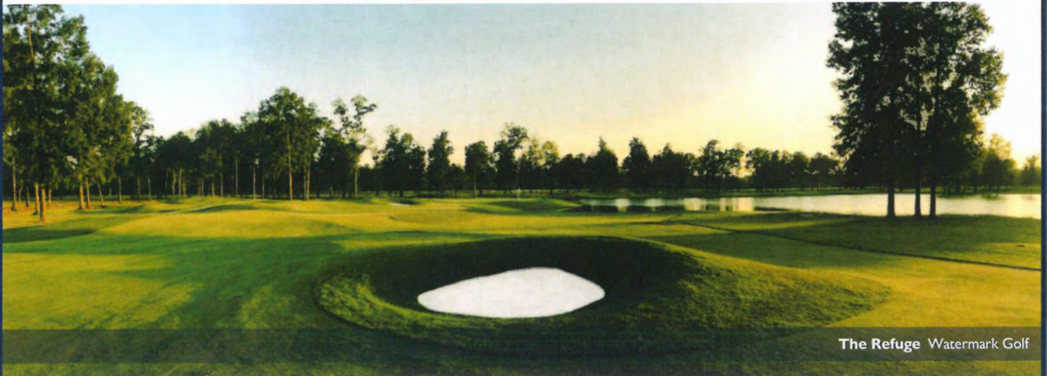
The Refuge Watermark Golf

Starting in 2017, a total renovation of this 18-hole upscale municipal golf course was completed in concert with construction of a new 10-story Sheraton hotel and conference center adjacent to the course. New greens, tees, bunkers, irrigation, and cart paths were part of the project that included creating returning nines from the old "nine out and nine back" layout.