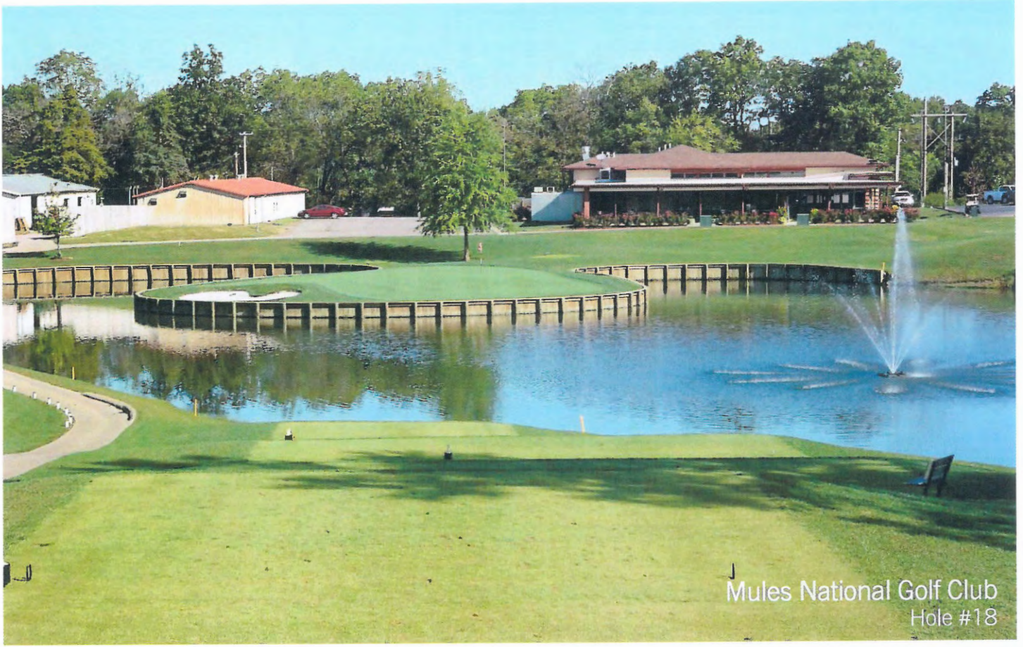
Mules National Golf Club Hole #18