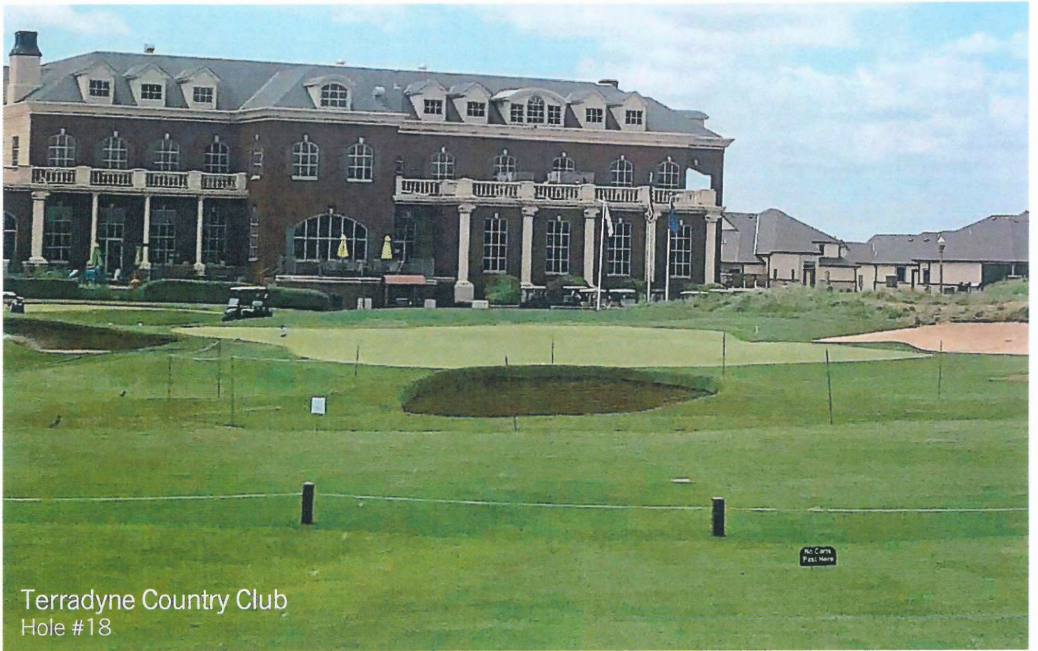
Terradyne Country Club Hole #18