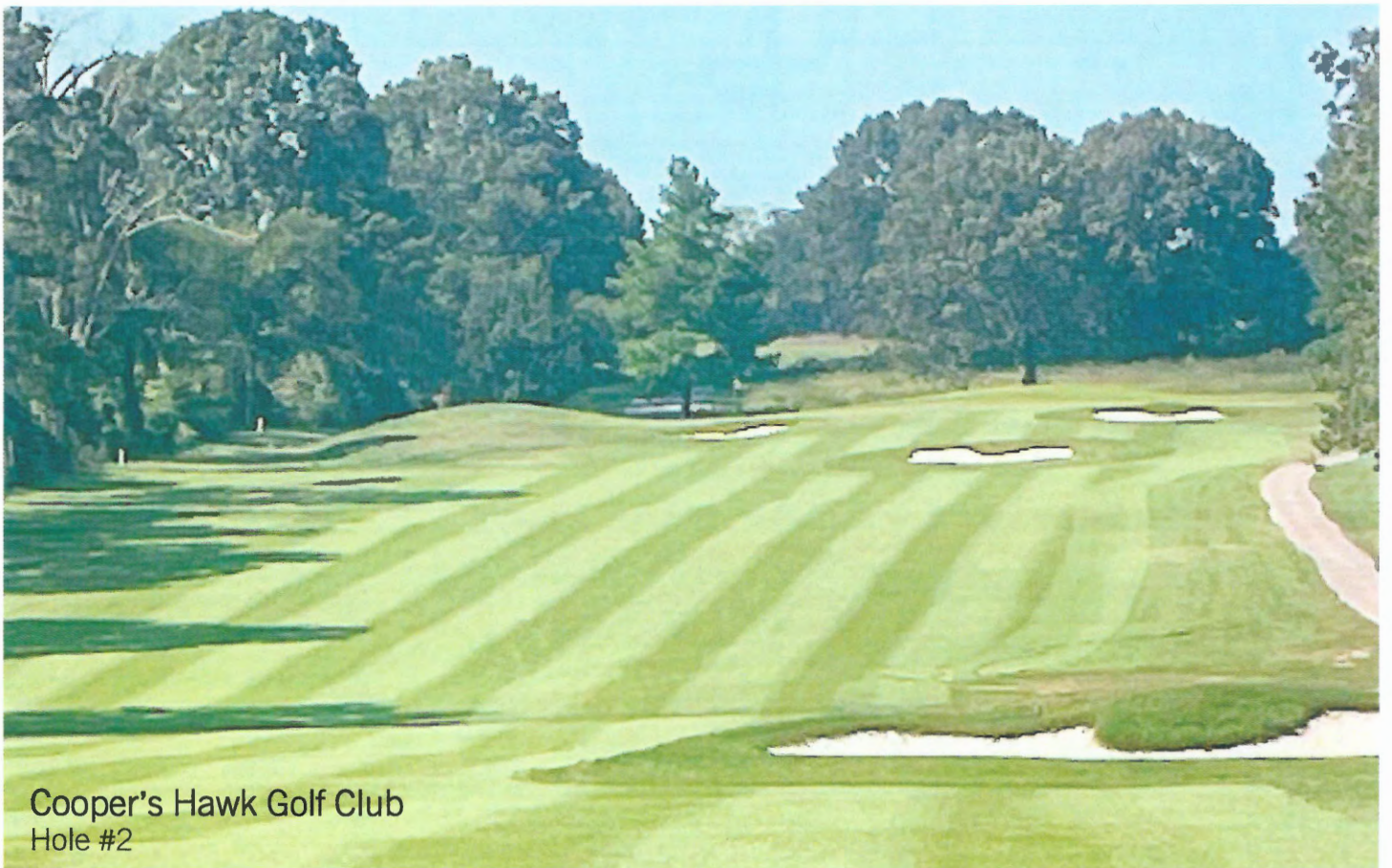
Cooper's Hawk Golf Club Hole #2