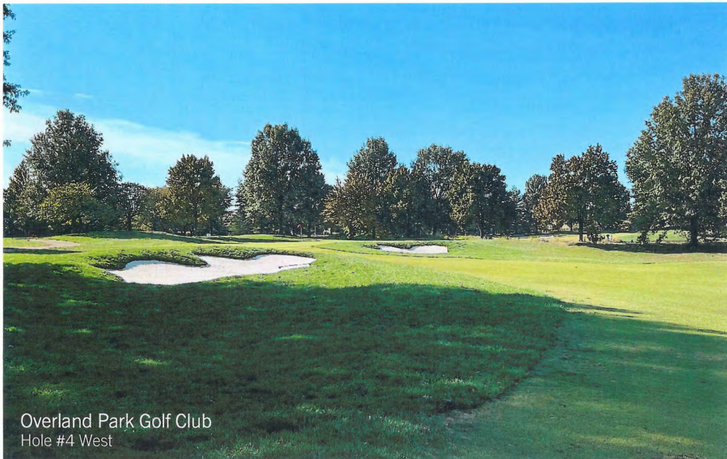
Overland Park Golf Club Hole #4 West