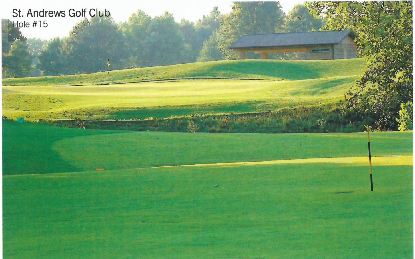
St. Andrews Golf Club Hole #15