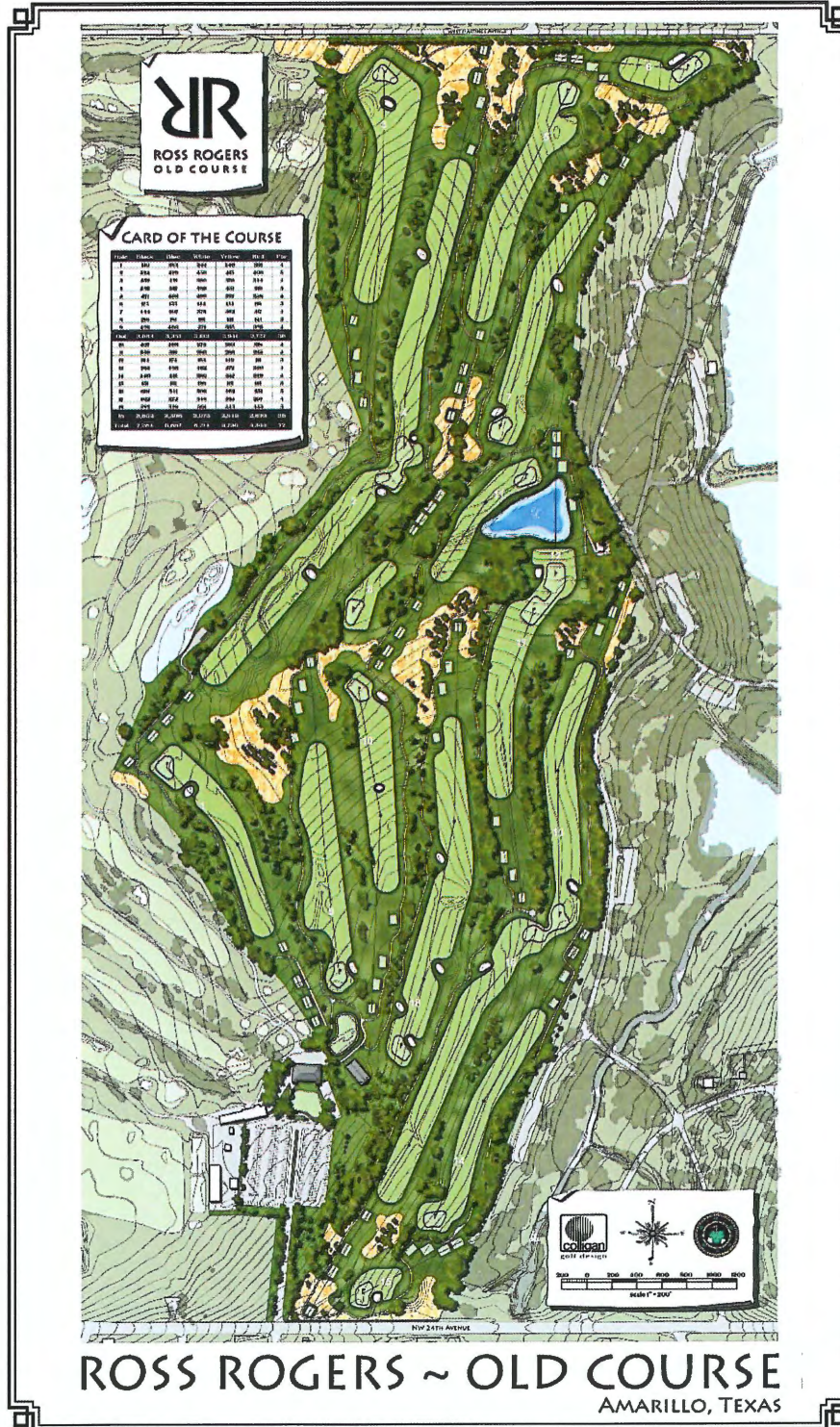
Ross Rogers Golf Complex (Mustang Course) - Amarillo, Texas