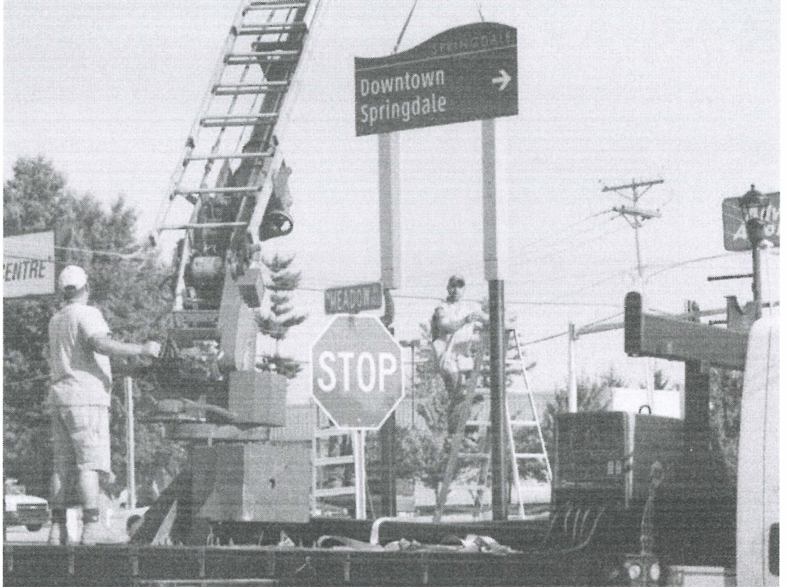
Wayfinding signage can help ensure visitors don't miss your city's attractions and amenities.

In addition to the economic effect wayfinding signage has on a city, signage is also a good way to establish a city's identity or brand. Signage should utilize the same colors and fonts as the city logo. Creating a consistent message through the city's brand will influence public perception, make investment in your community attractive, support tourism activities, and provide citizens with a sense of identity.