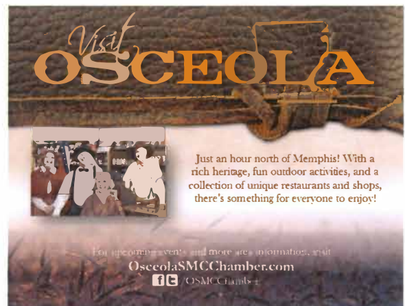
Sample half page Actual size 5.25" x 4.0625"